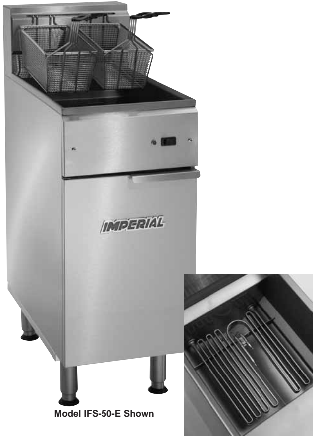
Model IFS-50-E Shown