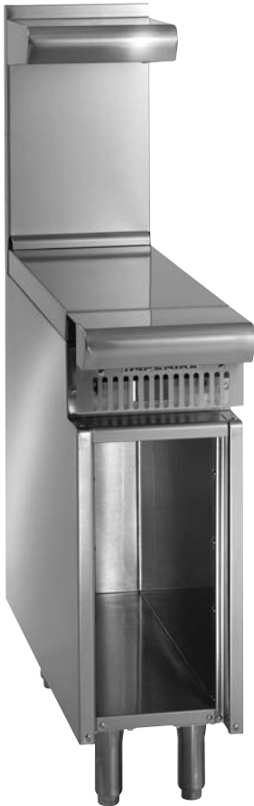
Model IHR-12SP shown with optional single deck high shelf