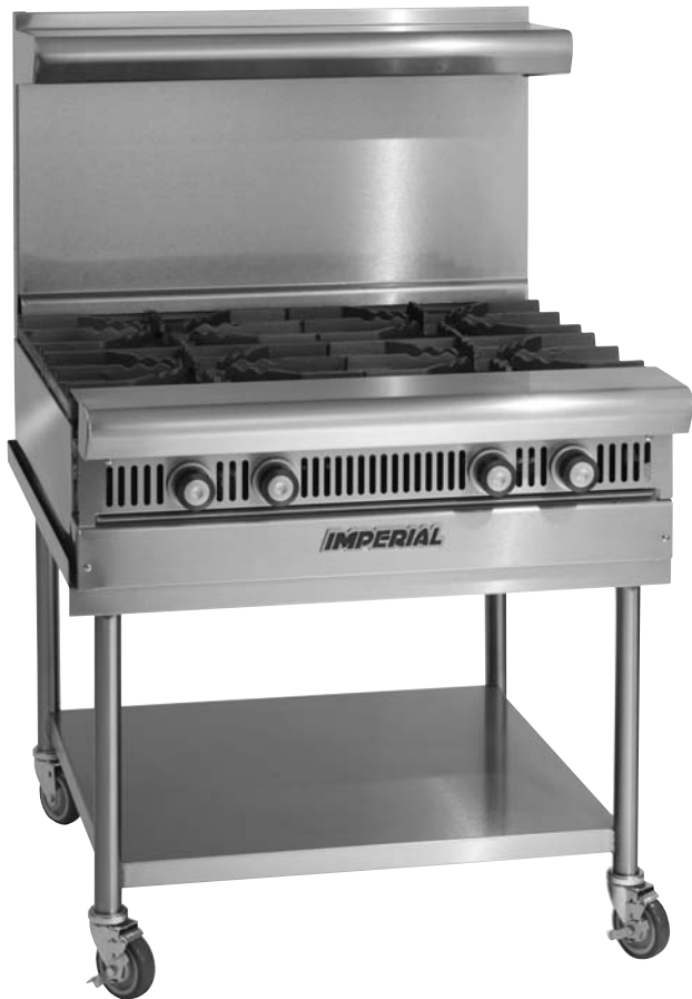
Model IHR-4-M shown with optional stand