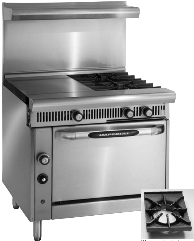
Model IHR-1HT-2 shown with stainless steel sides, backguard and shelf