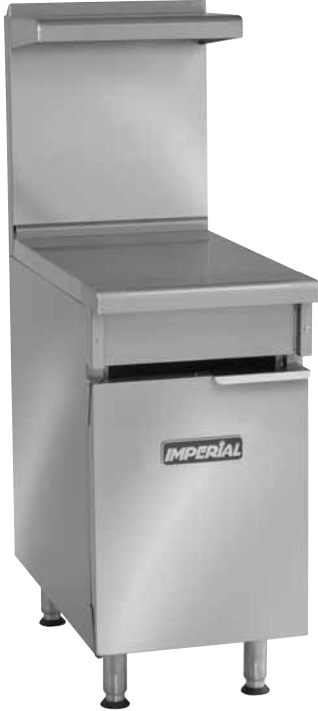
Model IR-18-SPR shown with optional stainless steel door