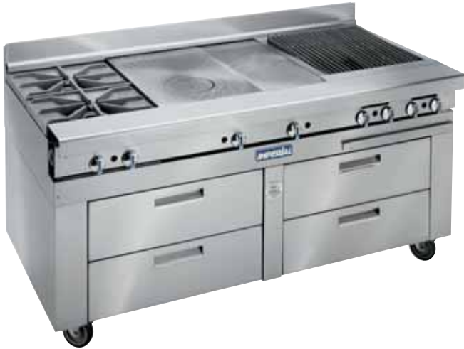
Model # IHR-2-18-1HT-1FT-RB24-4-RM-72 shown with Remote Condensing Unit