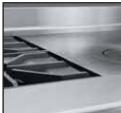
Pots and pans slide easily over level cooking surfaces