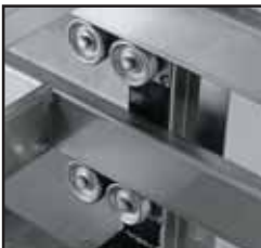
Double skate rollers for added drawer durability